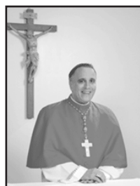
His Eminence Daniel Cardinal DiNardo

The Archdiocese of Galveston-Houston is one of fifteen dioceses in Texas, making the Texas province the largest in the world. The Canon Law Society is pleased to celebrate this Seventy-Eighth Convention in the Lone Star State, and we are grateful for the assistance and planning of our host archdiocese and tribunal.